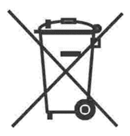
Part B: Symbol for separate collection of batteries